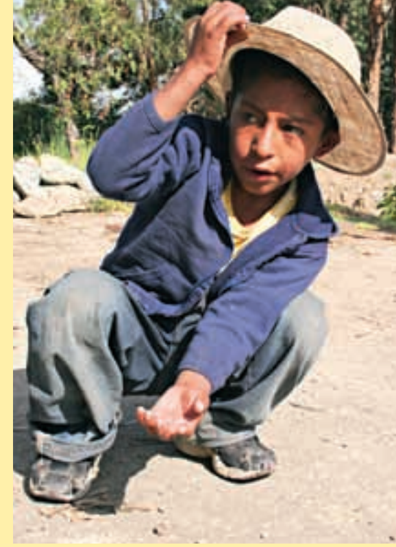
Indigenous children in Cochabamba, Bolivia.

failure if they do not accomplish all the objectives of their project. Furthermore, it is true that we feel a change of "generation" on the part of volunteers who may have a less "militant" vision. But we cannot generalise naturally. There are many differences between people and between the NGOs to which they belong.