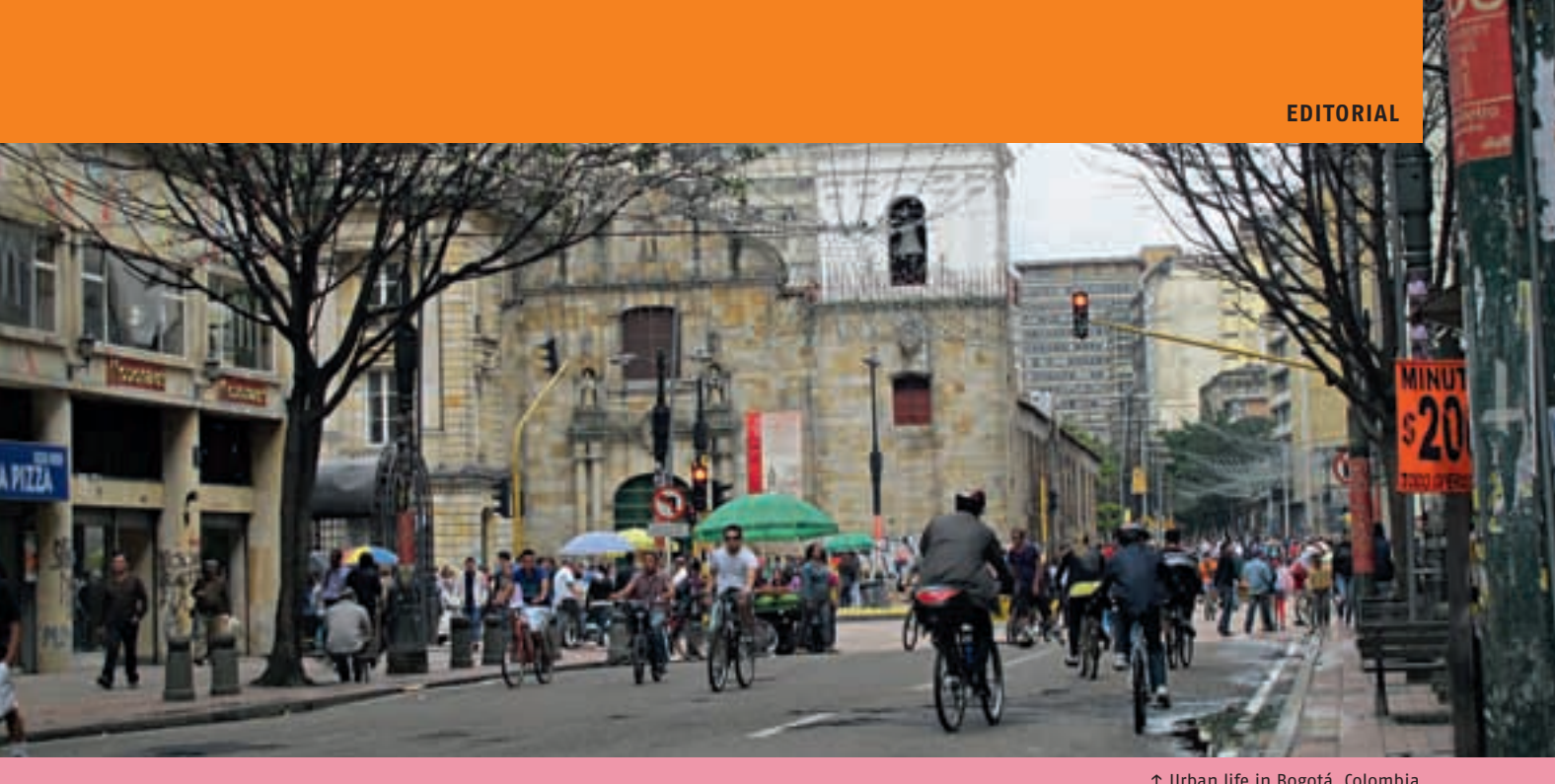
↑ Urban life in Bogotá, Colombia.