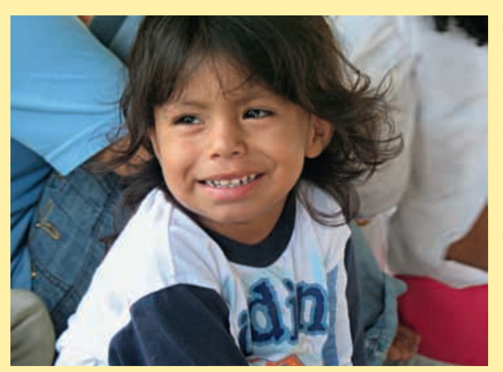
← ↑ Peasant children in Northern Colombia.

Switzerland can help in different ways in the development of Colombia; by buying fair trade products, for example. But people should also be aware that when buying drugs they fund a bloody war, they help to increase common crime and encourage corruption. They should also know that buying bio fuels, whose production is heavily promoted in Colombia, they have their share of the responsibility for their disastrous effects on food security and the environment in the South. The Swiss can bring a more general help by supporting the efforts of Swiss NGOs working in Colombia, as well as the collaboration activities of the state. And this not only for altruistic reasons: it is also self-interest. Indeed, in this globalised world, the social and economic problems of the South have an impact on the welfare of the North. Illegal migration increases the social and political tensions in the host country. Moreover, developed nations are being increasingly forced to accept lower living standards to prevent that their companies outsource production to countries where democracy is weak, environmental standards are less demanding and the labour code is less strict.