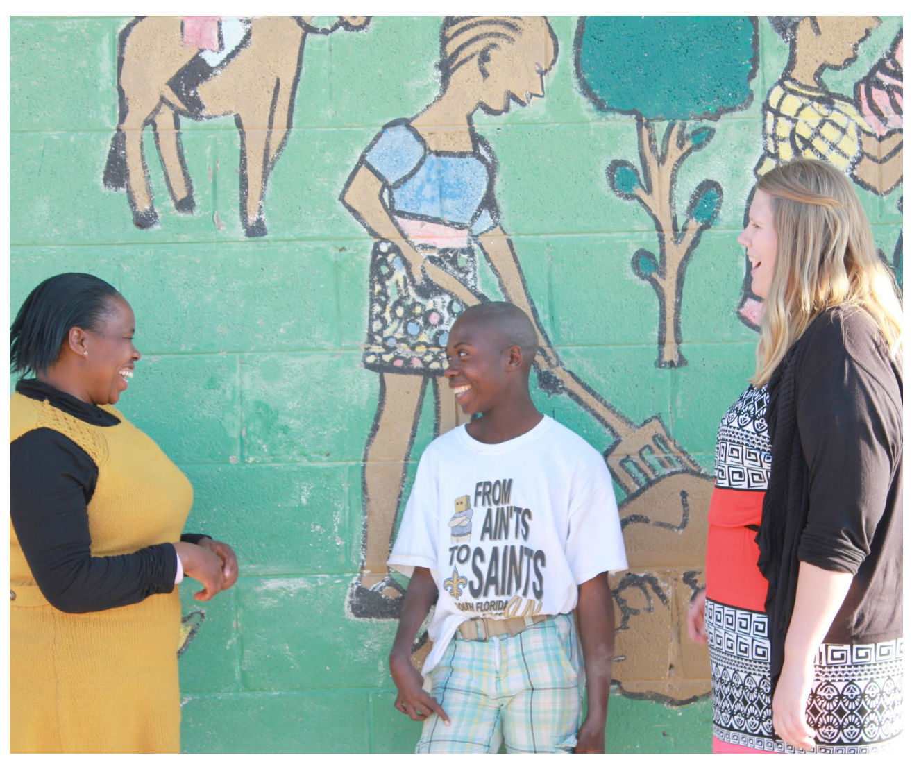
Above > (I-r) Colleague and student of Australian volunteer, Community Speech Therapist, at the Thuso E Tla Tsoa Kae Handicapped Centre, Lesotho.

World Health Organisation and the World Bank, World Report on Disability 2011 , available at: <a href="http://www.who.int/disabilities/world-report/2011/en/">http://www.who.int/disabilities/world report/2011/en/</a>