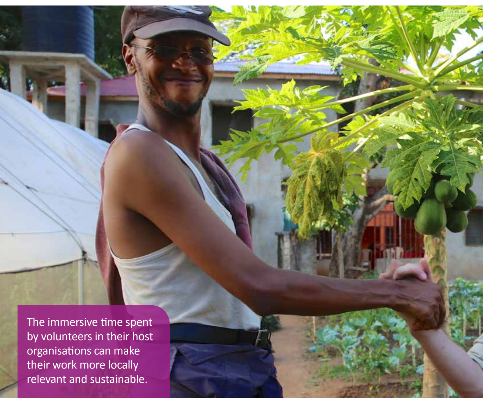
An Australian volunteer trained Kenyan volunteers in sustainable horticulture, a skill which they used to help farmers recover from a drought crisis.