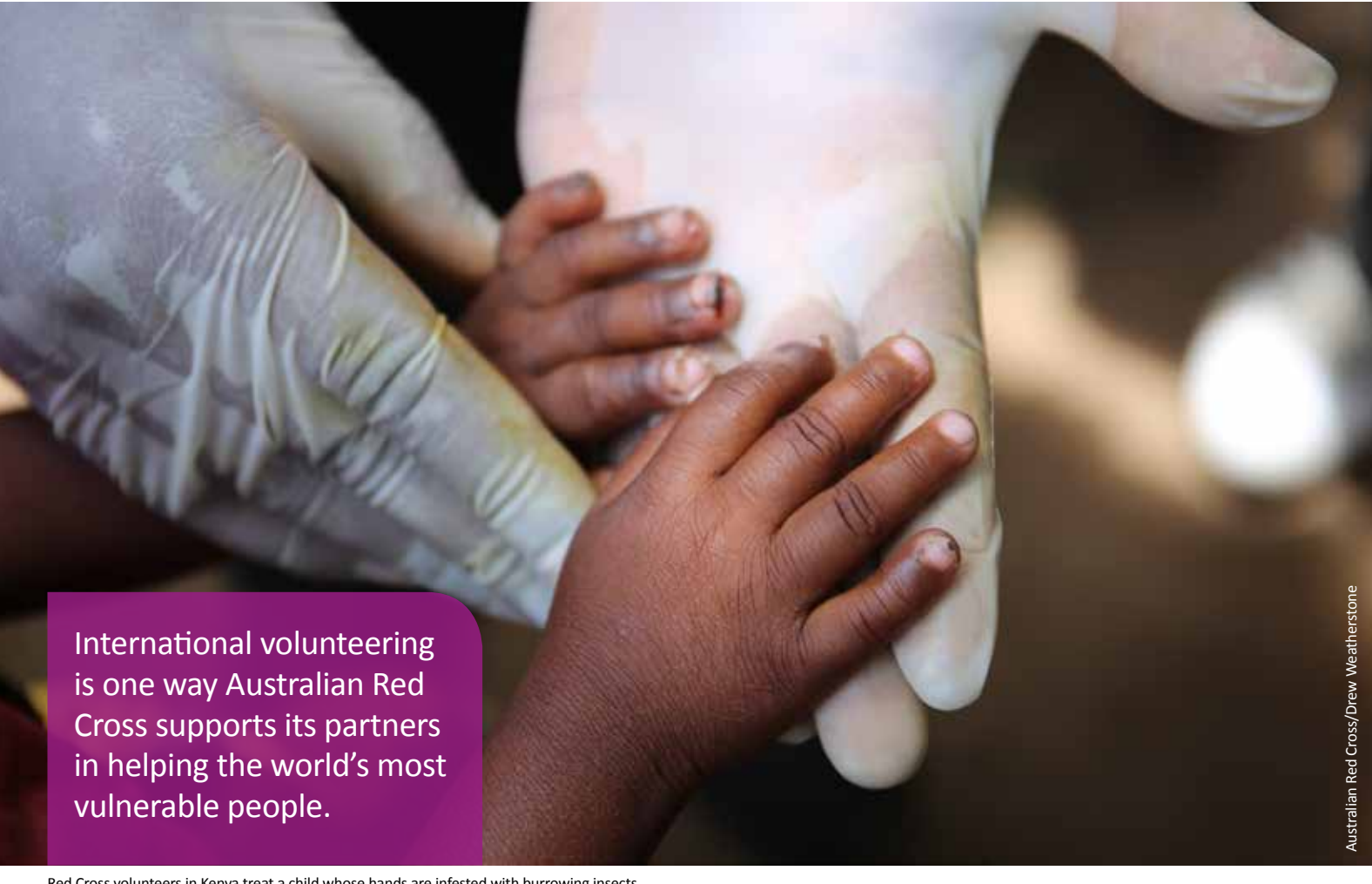
Red Cross volunteers in Kenya treat a child whose hands are infested with burrowing insects.