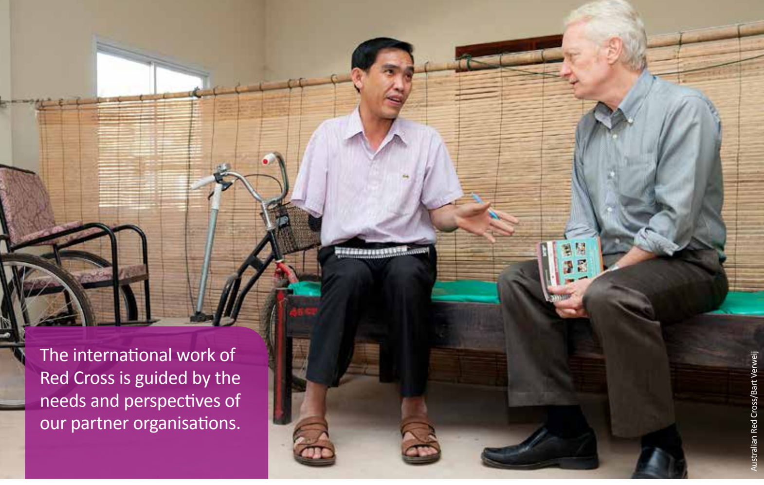
Australian volunteers in Laos are working with disabled people's organisations on advocacy and strategy.

This research examines the ways in which international volunteering has an effect on local communities and host organisations, illustrating its effectiveness as a development tool.