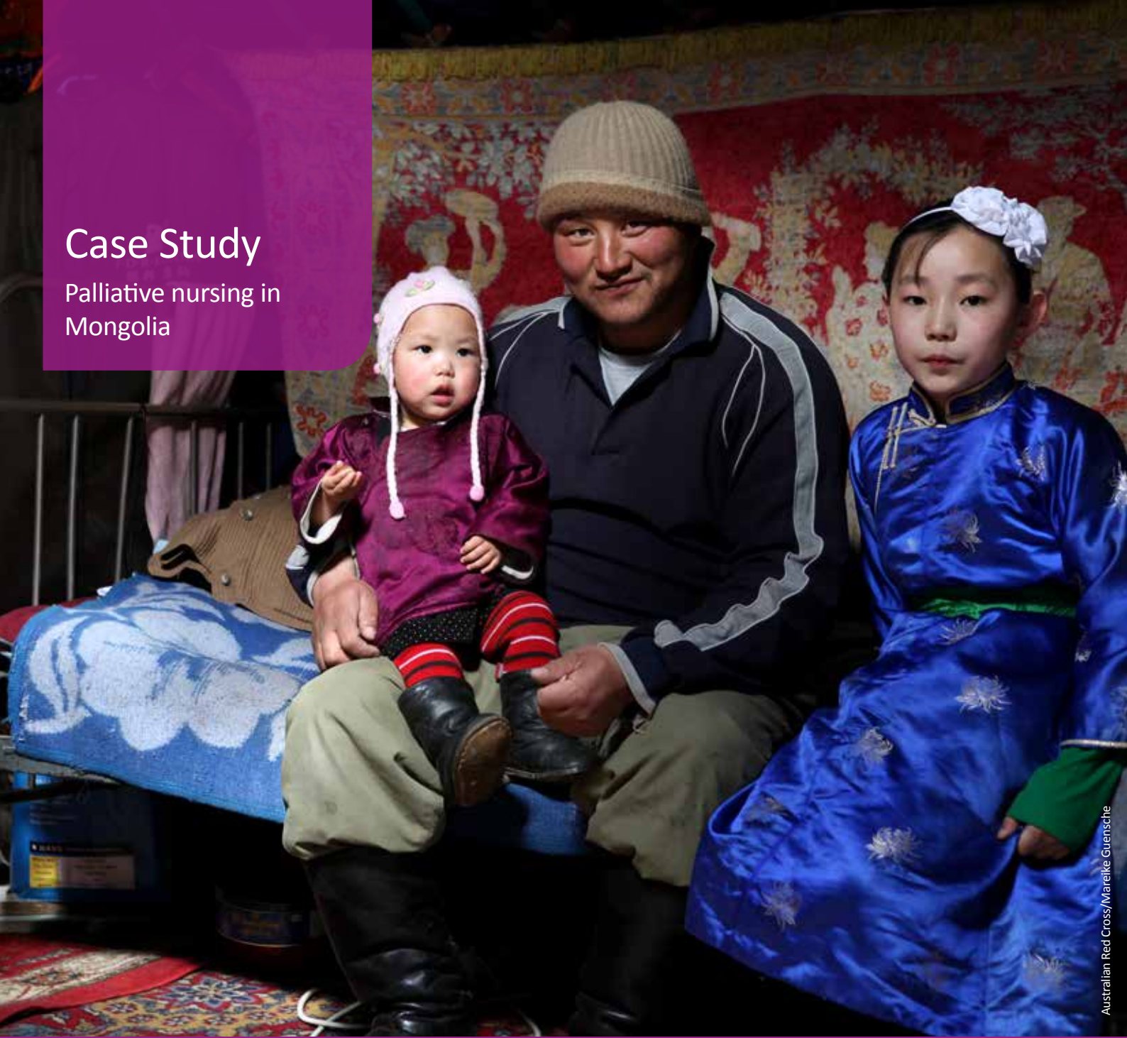
A herder family in Mongolia.

A volunteer nurse was assigned to the palliative care ward of a Mongolian hospital to support the professional development of local nurses and develop guidelines and training materials.