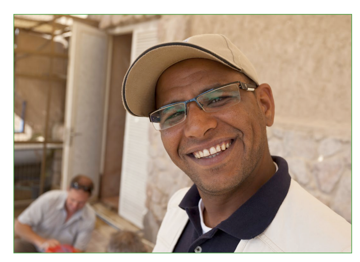
Above > Staff member at Aqaba Special Economic Zone Authority (ASEZA), with Australian volunteer Marine Park Management Adviser (background), in Aqaba, Jordan.