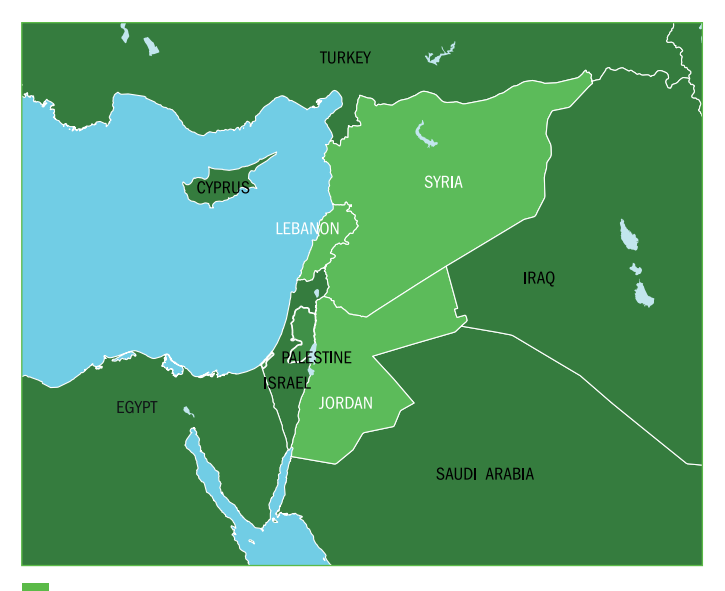
Countries in which AVI has placed volunteers (Lebanon, Jordan and Syria)

Of the 61 volunteer assignments, 28 were in United Nations (UN) agencies, 23 in local non-government organisations (NGOs), eight in international NGOs, and two in government positions. Table 1 (overleaf) summarises the first 10 years of the Middle East program.