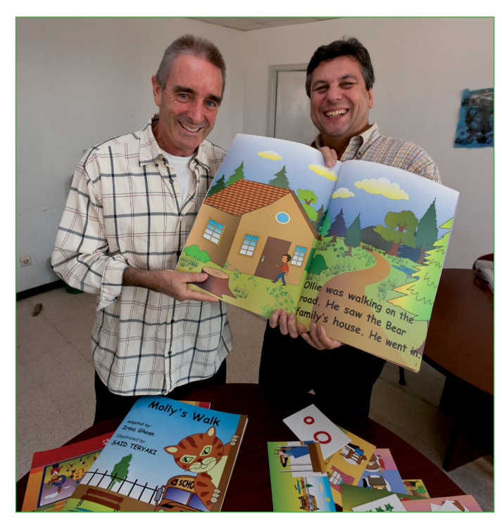
Above > Australian volunteer English Language Adviser (left) and UNRWA Education Team's School Supervisor, showing new English language text books for Palestinian refugee schools in Lebanon.